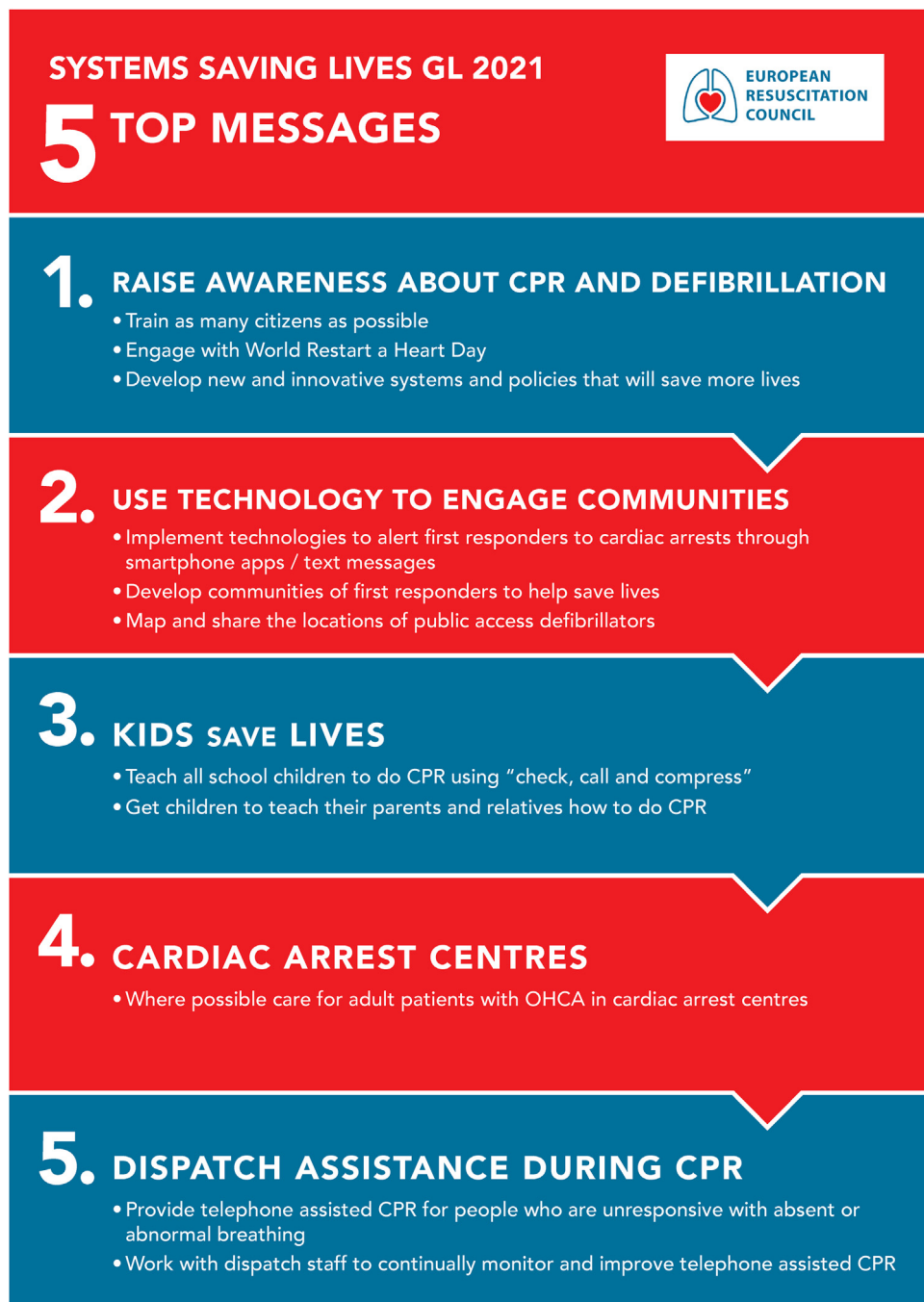
Fig. 1 – System saving lives infographic summary.

In the past, the guidelines of the ERC have been developed from a perspective of an ideal high-resource or high-income environment. Little attention has been paid to the applicability of statements from such areas in the daily practice of lower-income regions. In many parts of the world, a high-resource standard of care is not available due to a lack of financial resources. For example, low-quality performance of EMS can be a barrier